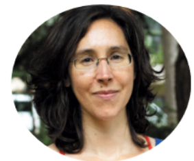
Alejandrina Cristia ENS PARIS, CNRS

Traditional laboratory experiments have significantly advanced our understanding of speech and language use, but a reliance on controlled environments limits our ability to ensure observations generalize to real-world communication. In this talk, I summarize some recent work on young children's speech development to introduce a novel approach that leverages long-form recordings from real-world interactions and machine learning to uncover the dynamics of speech behavior as it naturally occurs. For instance, in a 13-author collaborative study, we analyzed over 40,000 hours of audio from 1,001 children across 12 countries, revealing maturation and speech exposure as more important predictors of infants' speech development than gender and socioeconomic status. Furthermore, we use state-of-the-art self-supervised learning models to argue that tailored biases are needed to face the rich variability of naturalistic audio. Finally, I'll discuss the promise of wearable technology to study language and communication, highlighting both the breakthroughs and the hurdles of venturing beyond the lab.