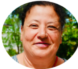
Nadera Bureau ILCB & AMU